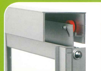
Concealed Head Track

Designed specifically for use with 4mm, 5mm and 6mm toughened glass. Will also accept 6.5mm laminated glass if desired.